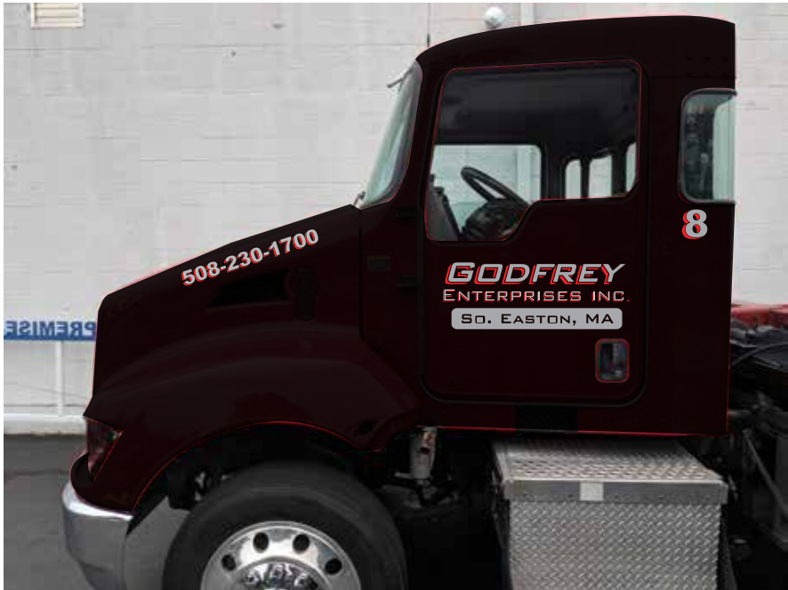
OPTION 1 (DRIVER SIDE)